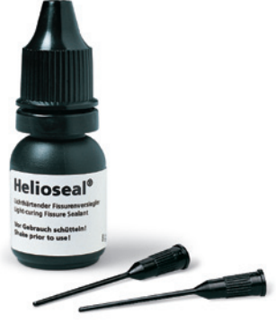
Helioseal The original sealant in a bottle

You can choose between three different light-curing resin-based Helioseal sealants to fulfil your sealing needs: