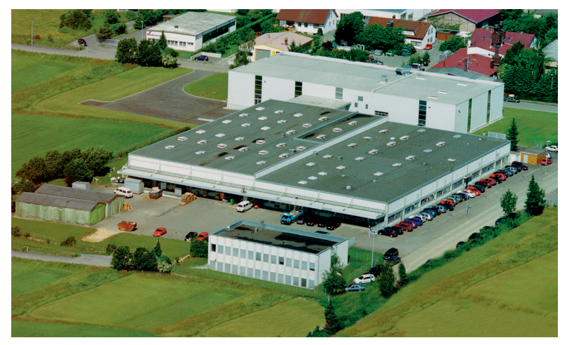
offices and factory in Langenau